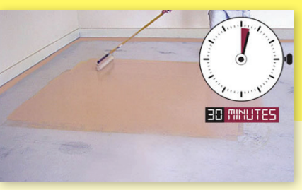
Base Coat Applied