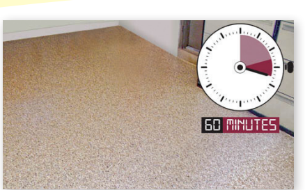
Wait 1 Hour