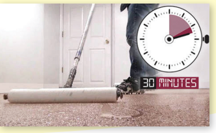
Clear Sealer Applied