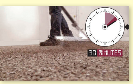
Excess Color Flakes Removed