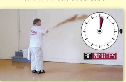
Color Flakes Applied