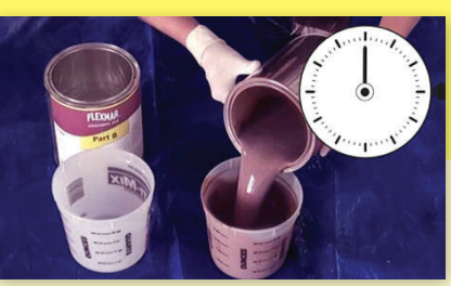
Mix Factory Pigmented / 1 to 1 Mix Ratio Base Coat