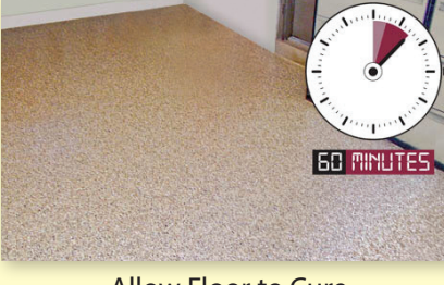
Allow Floor to Cure