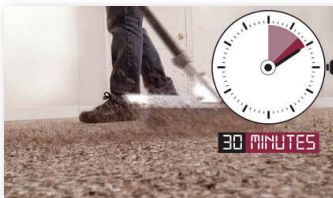
Excess Color Flakes Removed