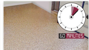
Allow Floor to Cure