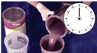
Mix Factory Pigmented / 1 to 1 Mix Ratio Base Coat

Surface Prep must be completed before Installation of FLEXMAR NEXTGEN