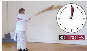
Color Flakes Applied