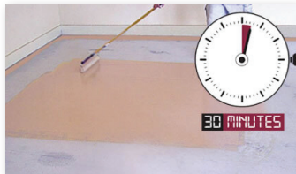
Base Coat Applied