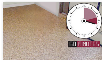
Wait 1 Hour