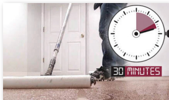
Clear Sealer Applied