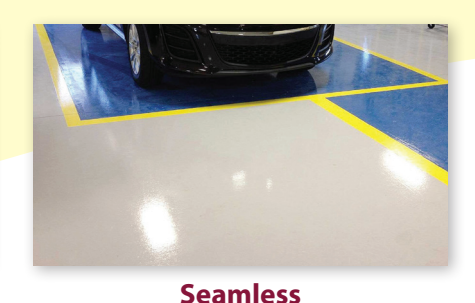
Cracks and seams are filled in and ground to create a seamless surface.