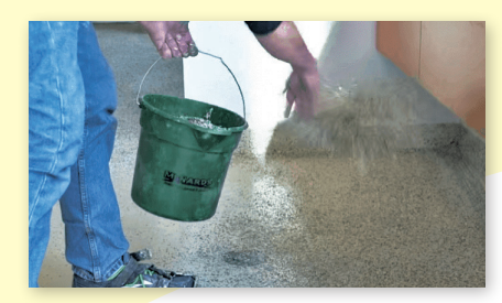
Decorative Vinyl chips are broadcast to rejection into the still-wet polyaspartic base coat.