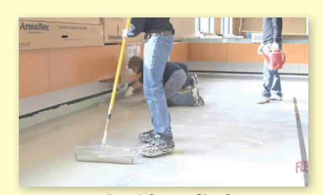
Liquid Applied Flexmar NextGen polyaspartics are poured and rolled onto the concrete flooring.